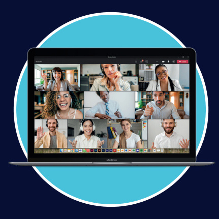
Start the meeting from your laptop