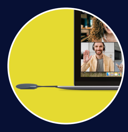
Connect CleverCast to your laptop